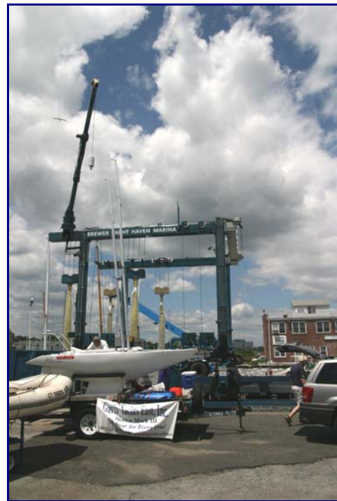
Getting ready for race day, September 2004. Brewer Yacht Haven Marina, Stamford, CT