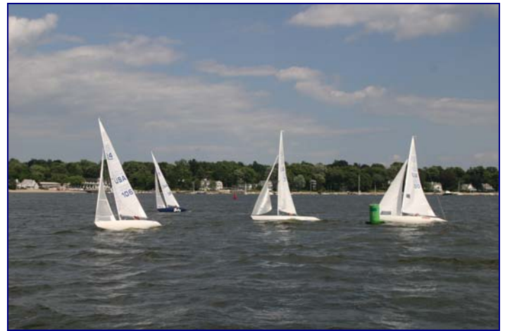
Some changes in position!