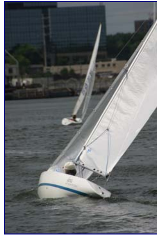
Practicing some upwind techniques.