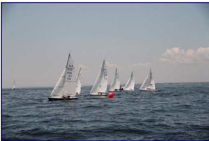
Rounding the windward mark.