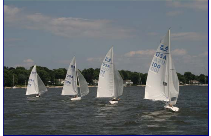
Approaching a leeward mar.,