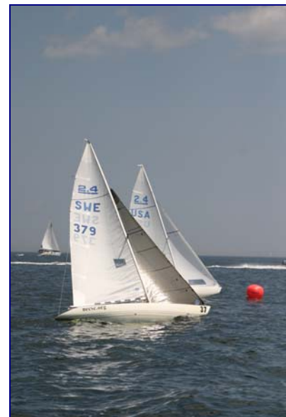
Some tight racing.